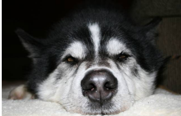
"Grounded.....until next time"

Our sled dog adoption has gone well this year, thanks to so many friends and contacts in the south. Brandy, Tala, Braveheart, and Sarah are now living in Calgary, Ottawa and Winnipeg. Savik will be leaving in January for Brooks, Alta. It's hard to say good-bye to our friends but we know it's the right thing to do in their retirement years.